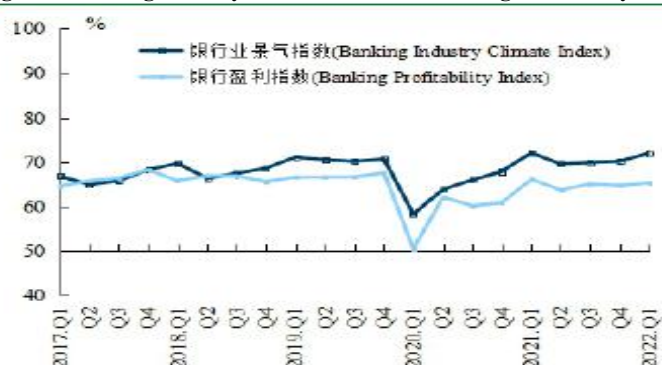
Figure 2: Banking Industry Climate Index and Banking Profitability Index