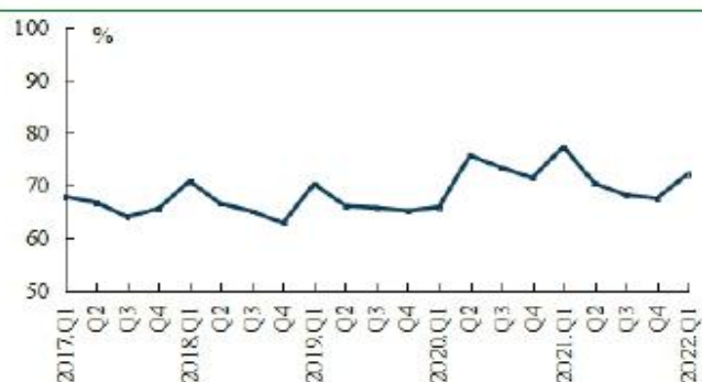
Figure 3: Overall Loan Demand Index