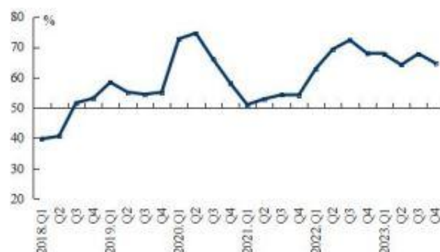
Figure 4: Monetary Policy Sentiment Index