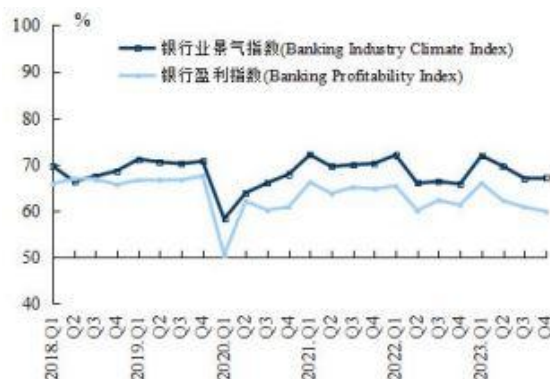
Figure 2: Banking Industry Climate Index and Banking Profitability Index

Source: Statistics and Analysis Department, PBOC.