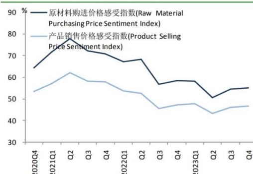
Figure 2: Product Selling Price Sentiment Index and Raw Material Purchasing Price Sentiment Index