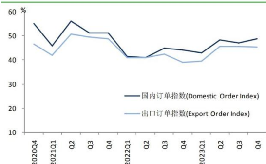
Figure 3: Export Order Index and Domestic Order Index