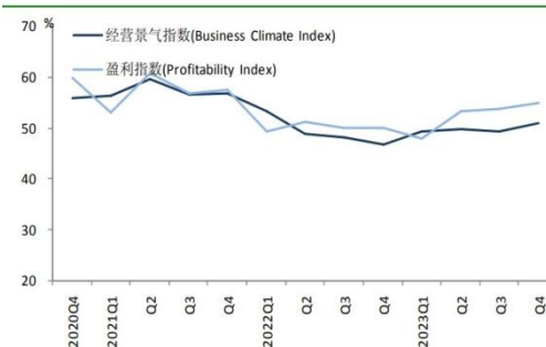
Figure 5: Business Climate Index and Profitability Index